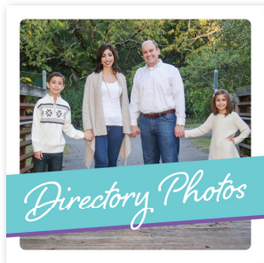
Pictorial directory info